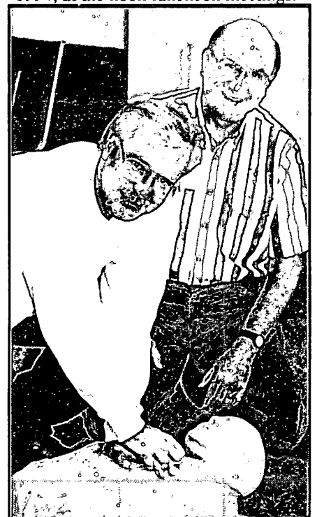
Rotarians enjoy CPR

Registration of $10.00 was collected on Monday, March 28 and April 4, 1994, at the noon luncheon meetings.