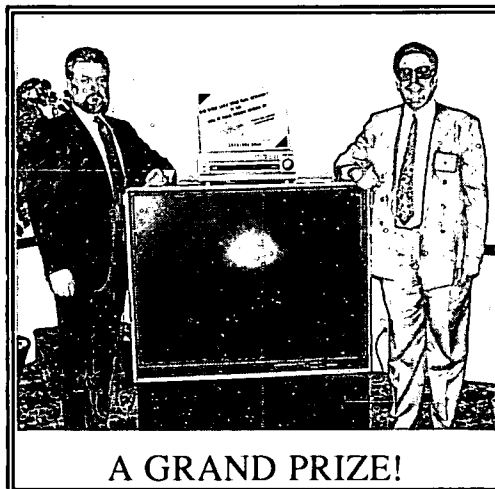
A GRAND PRIZE!